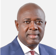
H.E. Sen. Heineken Lokpobiri, Ph.D

Honourable Minister of State for Petroleum Resources (Oil) Federal Republic of Nigeria