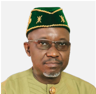
H. E. Rt. Hon. Ekperikpe Ekpo, Ph.D

Honourable Minister of State for Petroleum Resources (Gas) Federal Republic of Nigeria